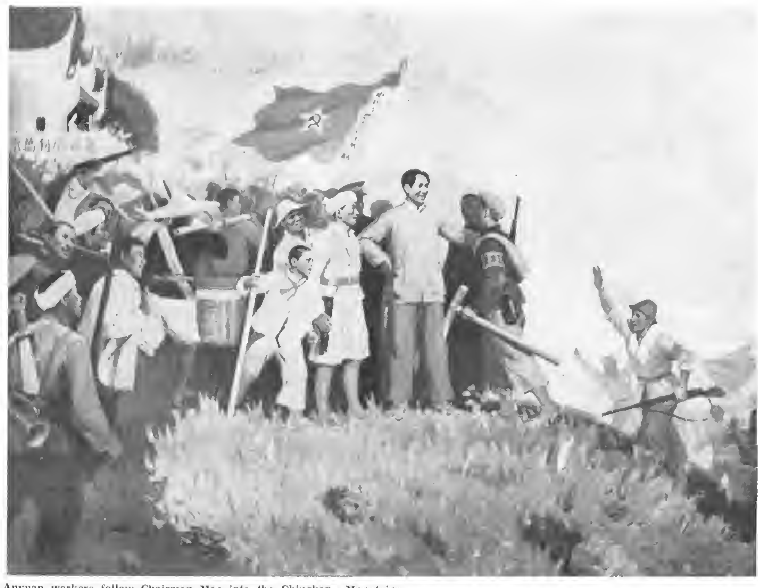
Anyuan workers follow Chairman Mao into the Chingkang Mountains.

Unable to eheek the strike, China's Khrushchov about-faeed and assumed the air of a saviour. "Now you must listen to me. . . . Go back to your quarters and don't create disturbances. . . . Fellow workers should act in a more civilized way than usual." He ordered the workers' representatives to see to it that "order is maintained". He was, in fact, trying to narrow the workers' struggle down to limits within which the rule of the reactionaries would not be touched.